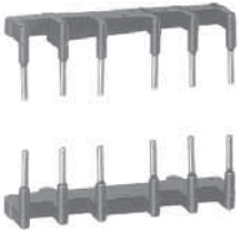
Load side (T) BSM6-30